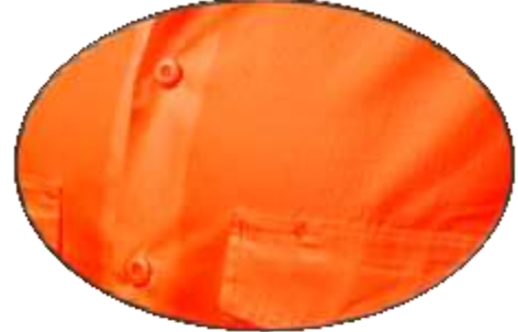
Figure 1 - Rip Stop Fabric